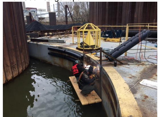
Assisting with cell repairs at Clifty Creek.