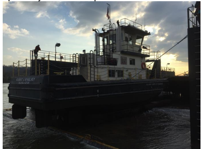
New cleaning rig set up at Hebron.