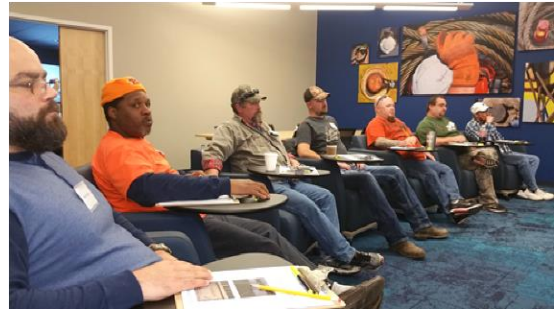
Miami Fort dock barge repair.

We have started sending groups back to Seamen's Church for advanced pilot training. We have 4 classes set up for 2017 and the training subjects will be different, as well as some of their equipment.